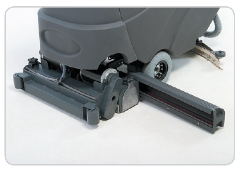
Cylindrical scrub decks sweep and scrub in a single pass with dual counter-rotating brushes. Polyethylene hopper eliminates corrosion.