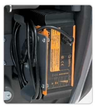
Standard onboard battery charger for wet or gel battery packages.