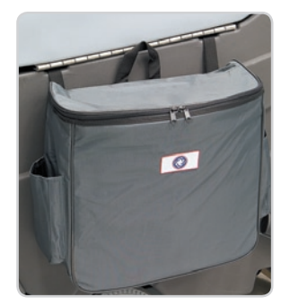
Onboard Tote Bag