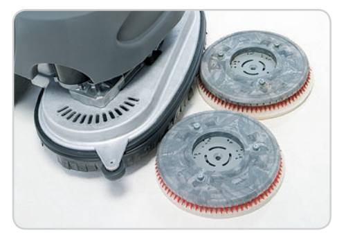
Click-off disc scrub heads for productivity and convenience.