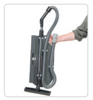
Onboard Scrub-Vac System

14600 21st Avenue North Plymouth, MN 55447-3408 www.advance-us.com Phone 800-214-7700 Fax 800-989-6566